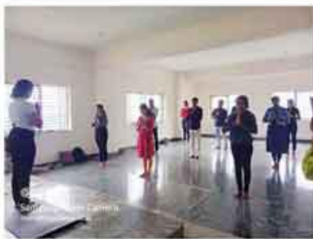
YOGA DAY CELEBRATED AT EWSA

EWSA ORGANIZED THE THE INTERNATIONAL YOGA DAY WITH GREAT ENTHUSIASM FOR THE STUDENTS AND STAFF. THE SESSION INCLUDED PRAYER FOLLOWED BY PRACTICING OF VARIOUS ASANAS, MEDITATION AND OM KAR ENDED WITH A PLEDGE.