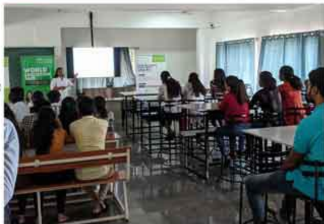
CARRIER EXPOSURE PRESENTATION AT EWSA

'CHOOSE THE RIGHT CAREER PATH AND YOUR LIFE WILL BE SORTED!'. CHOOSING THE RIGHT CAREER PATH CAN BE A BREAKTHROUGH POINT FOR STUDENTS IF DONE RIGHT. STARTING A CAREER IN ARCHITECTURE AND PLANNING IS AN EXCITING PROSPECT, BUT IT IS IMPORTANT TO RESEARCH BEFORE TAKING THE PLUNGE. A WORKSHOP BY LOMOS WAS ORGANIZED BY EWSA FOR THE 7TH & 9TH SEMESTER STUDENTS TO FOCUS ON PORTFOLIO CREATION AND PROFESSIONAL CAREER GUIDANCE IN THE FIELD OF ARCHITECTURE.