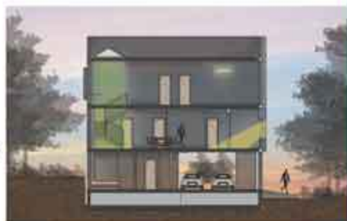
WORKSHOP OUTPUT FROM STUDENTS

A SEMINAR BY SIEC EDUCATION PRIVATE LIMITED WAS ORGANIZED BY EWSA FOR THE 7TH & 9TH SEMESTER STUDENTS TO HELP THEM PLAN THEIR HIGHER STUDIES ABROAD. THE SPEAKER DISCUSSED VARIOUS POSSIBLE COUNTRY OPTIONS, AVAILABLE COURSES, JOB OPPORTUNITIES, STAY BACK OPTIONS, RELEVANT TEST & EXAMS AND PREPARATION FOR THE SAME. PORTFOLIO MAKING AND PROFESSIONAL CAREER GUIDANCE WORKSHOP: