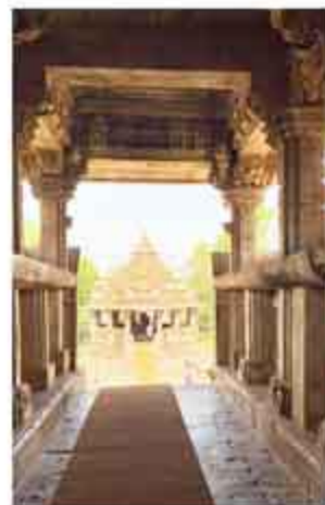
MP, UP STUDY TOUR